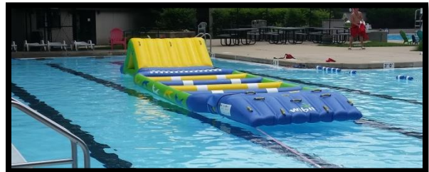
Wibit Obstacle Course